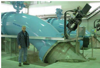
Piping Systems and Diffusers